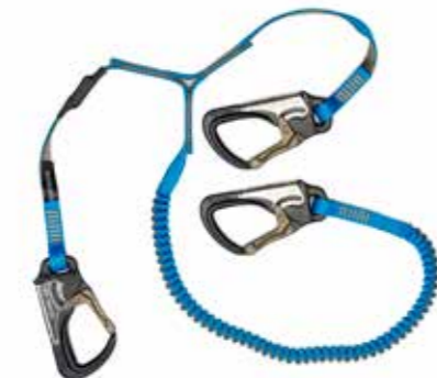
3 CLIP, STRETCH DW-STR/03/C