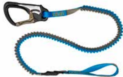
1 CLIP, 1 LOOP, STRETCH DW-STR/2LE/C