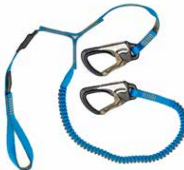
2 CLIP, 1 LOOP, STRETCH DW-STR/3L/C