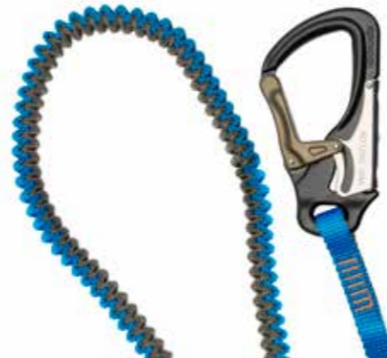
JET BLACK CLIP & NEW BRAID COLOURWAY