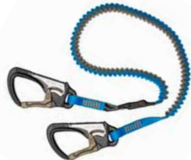
2 CLIP, STRETCH DW-STR/02E/C