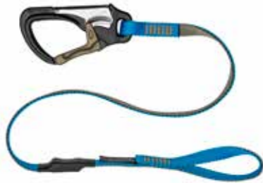
1 CLIP, 1 LOOP DW-STR/1L/C